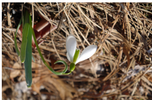
Snowdrop - Galanthus 'George Elwes'

Bridge Gardens, 36 Mitchell Lane, Bridgehampton $5/person, free to Bridge Gardens and our Community Garden members. Reservations requested. Rain or shine