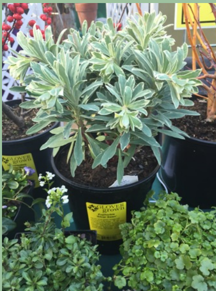
Euphorbia 'Silver Swan'