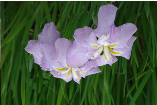
Iris ensata 'Light-n-Opal'

Saturday, August 22, 9 am - 5 pm, Breakfast, Panel & Tour of 5 private gardens and 4 farms