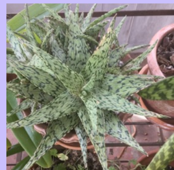
above - Aloe 'Delta Lights'