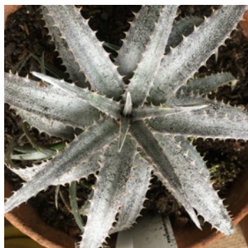
Dyckia 'Nickel Silver'

Saturday, June 18, 11:00 - 5:00 - Garden Tour, gardens in Bridgehampton, Sagaponack & Wainscott, tickets $85. Rain or Shine