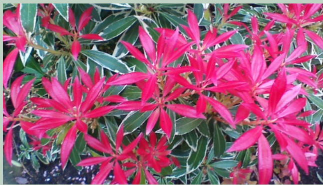
Pieris 'Flaming Silver'

Spring makes its own statement, so loud and clear that the gardener seems to be only one of the instruments, not the composer.----Geoffrey B. Charlesworth