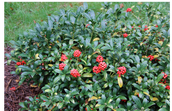
Skimmia japonica (female)

* = Deer Resistant in my neighborhood in Bridgehampton