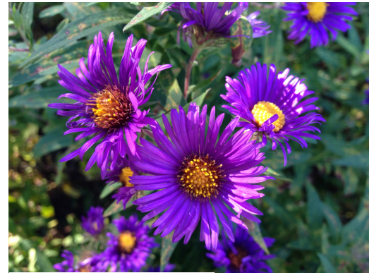
Aster 'Purple Dome'

Ajuga * -bronze Amsonia (blue star) * -yellow Azalea -various Berberis thunbergii (barberry) * - beautiful, but on the invasive list Ceratostigma plumbaginoides (plumbago) * -red Clethra -yellow Cornus florida -bronze Cornus kousa (dogwood) -bronze Cotinus coggygria (smoke bush) Fothergilla Hamamelis virginiana (witch hazel)* Hibiscus syriaca (rose of Sharon) -yellow Hydrangea quercifolia (oakleaf) - bronze/red Hypericum (St. John's Wort) * - bronze Imperata (Japanese blood grass) * -red Lagerstroemia (crape myrtle) * - bronze Lindera benzoin (spicebush)* - yellow Miscanthus purpurea (flame grass) * Peony * -bronze Rhododendron PJM – bronze Rhus (sumac) Spirea 'Goldflame' *-red Vaccinium (blueberry) - red Viburnum -bronze - *deer resistant after flowering