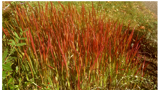
Imperata (Japanese blood grass) * -red