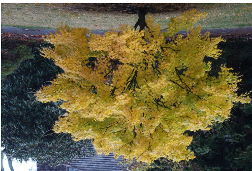
Acer palmatum "Aoyagi"

Bridge Gardens, Madoo and LongHouse Reserve are now closed for visiting until Spring.