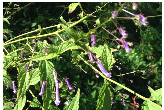
Rabdosia longituba (trumpet spurflower) *

Agastache * Astilbe* Baptisia australis (false indigo) * -large black seed pods Echinacea (purple coneflower) Echinops (globe thistle) * Eryngium (sea holly) * Hydrangea (all varieties) –large, dried blooms Rudbeckia (black-eyed Susan) –self seeds