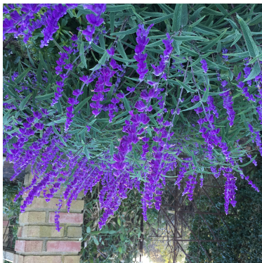
Salvia 'Santa Barbara'