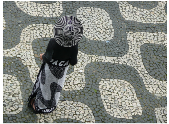
Rio

For those who would enjoy it, you'll also have an opportunity to visit nearby Arthur Avenue for shopping in specialty Italian food stores.