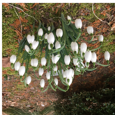
Early Snowdrop, Galanthus elwesii 'Mrs. Macnamara'

The Horticultural Alliance of the Hamptons Bridgehampton Community House P.O. Box 202 Bridgehampton, NY 11932-0202 (631) 537-2223 www.hahgarden.org