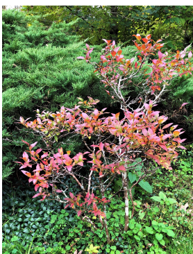
Blueberries from Pat Wood

I "garden" (with husband, Ron) just north of the village of Southampton. About 15 years ago, I started working at it in earnest. I tore out invasive honeysuckle and roses, but most of what I planted instead was exotic. I found plants the deer did not eat. When I wanted to hide the wood pile, I planted a few sprigs of forsythia and waited. (I had plenty of time.) I moved plant "babies" (farmers call them volunteers), especially Viburnum tomentosa and Osmanthus . These exotics were among the few shrubs the deer did not chew to the ground. I took to heart advice not to grow lawn where lawn doesn't want to be, and I planted ferns. Unfortunately, I did not know about all the lovely ferns that are Long Island natives. And I will always treasure anything from an HAH member. I love the Abelia that was five inches tall and is now 5 feet. I love the swath of hellebores at the foot of an oak tree. And I love Fran Himmelfarb's Styrax japonicas and Kousa dogwoods. If only Kousas fed birds.