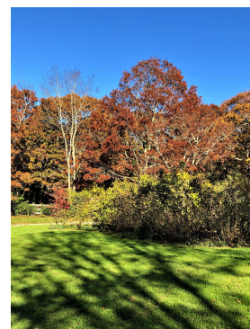
This oak was 3 feet tall when I found it.

As luck would have it, I have done some things that turned out to be helpful to our local bugs and birds. I encourage trees, and we now have oaks (supporter of the largest number of species of caterpillar), cherries (second largest number), sassafras, cedars, Ilex opaca (American holly) and even a few shads. I also have some volunteer Viburnum that I think are dentatum (arrowwood), a native. I have planted Ilex glabra , Clethra and blueberries. I've left in place trunks of trees snapped off in hurricanes. You should see all the wonderful holes. I love leaf litter and winter seed heads. And a few years ago, we started mowing fallen leaves (mostly oak) so they would break down faster. We rake some and leave some on the lawn. One of my favorite tips, from an HAH Roundtable, was to pile mulched leaves near where I would use them in the spring. Saves a lot of hauling.