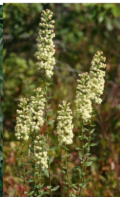
Solidago bicolor White goldenrod

Goldenrods are the top-ranked herbaceous plants for biodiversity and provide important late-season nectar and pollen for our declining pollinators.