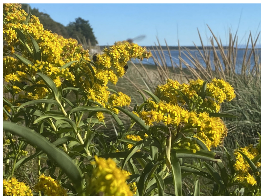
Solidago sempervirens , Seaside goldenrod Shinnecock Bay