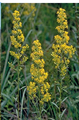
Solidago speciosa Showy goldenrod