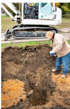
Dig hole with deep well in center.