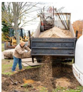
Add sand to create a sand wick for good drainage.