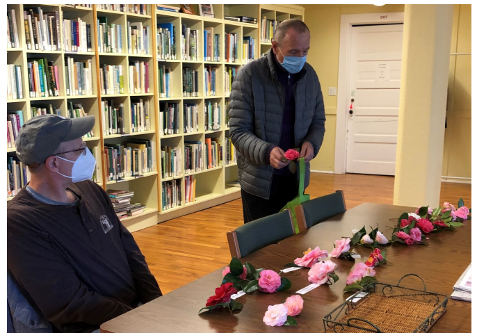
We had lots of blooms