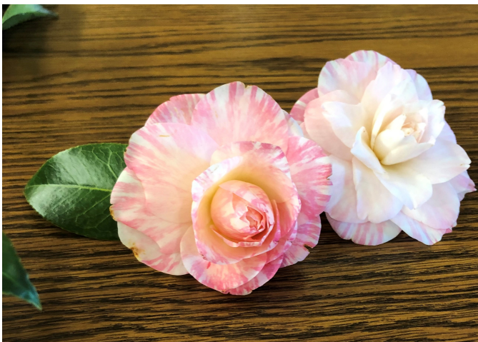
The stars of the meeting