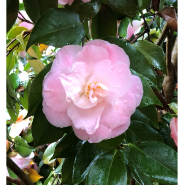
"April Remembered" in George Biercuck's garden