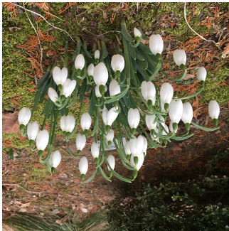
Galanthus elwesii 'Mrs. Macnamara'