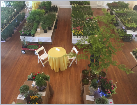
At the Bridgehampton Community House 2357 Montauk Highway at School Street, Bridgehampton

Please join us for our Spring Garden Fair Preview Friday, May 19, 2023 5:00 - 7:00 pm